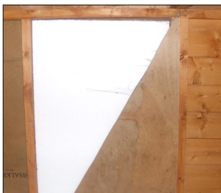
CELOTEX & PLYWOOD