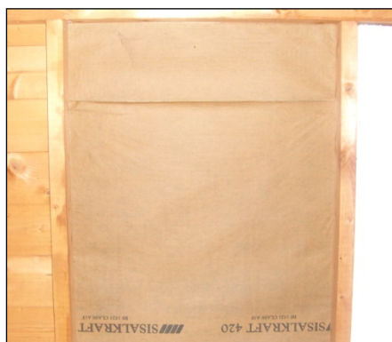
BREATHER PAPER MEMBRANE