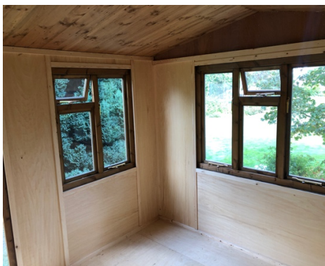
EARTHWOOL & PLYWOOD